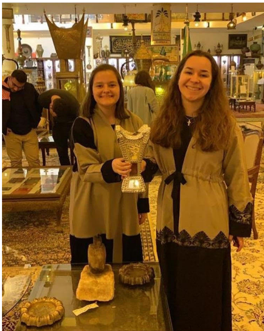
Shopping in a store

The Saudi Vision 2030 plan is a strategy to diversify the Saudi economy and develop the country's infrastructure, capacities, and influence, which will allow the Kingdom to compete economically on the international stage. The Saudi Vision 2030 plan spearheaded this modernization through progressive goal setting. The plan commits to "providing opportunities for all" through various means and "unlocking the talent, potential, and dedication of our young men and women". This inclusion of all Saudis, specifically women, in the language of the 2030 Plan paved the path towards more progressive laws for Saudi women. As of 2017, laws were passed in Saudi Arabia that granted women equal treatment in the workplace, permitted them to obtain family documents from the government, and allowed them to obtain a passport and travel without permission from a wali, or a male guardian. 1 In addition, women can get a driver's license, can spectate sports, and no longer have to wear an abaya so long as they dress modestly. 2 Although these freedoms are put into law, do they actually reach the lives of Saudi women? This question, among many others, was what I aimed to answer on my trip to the Kingdom.