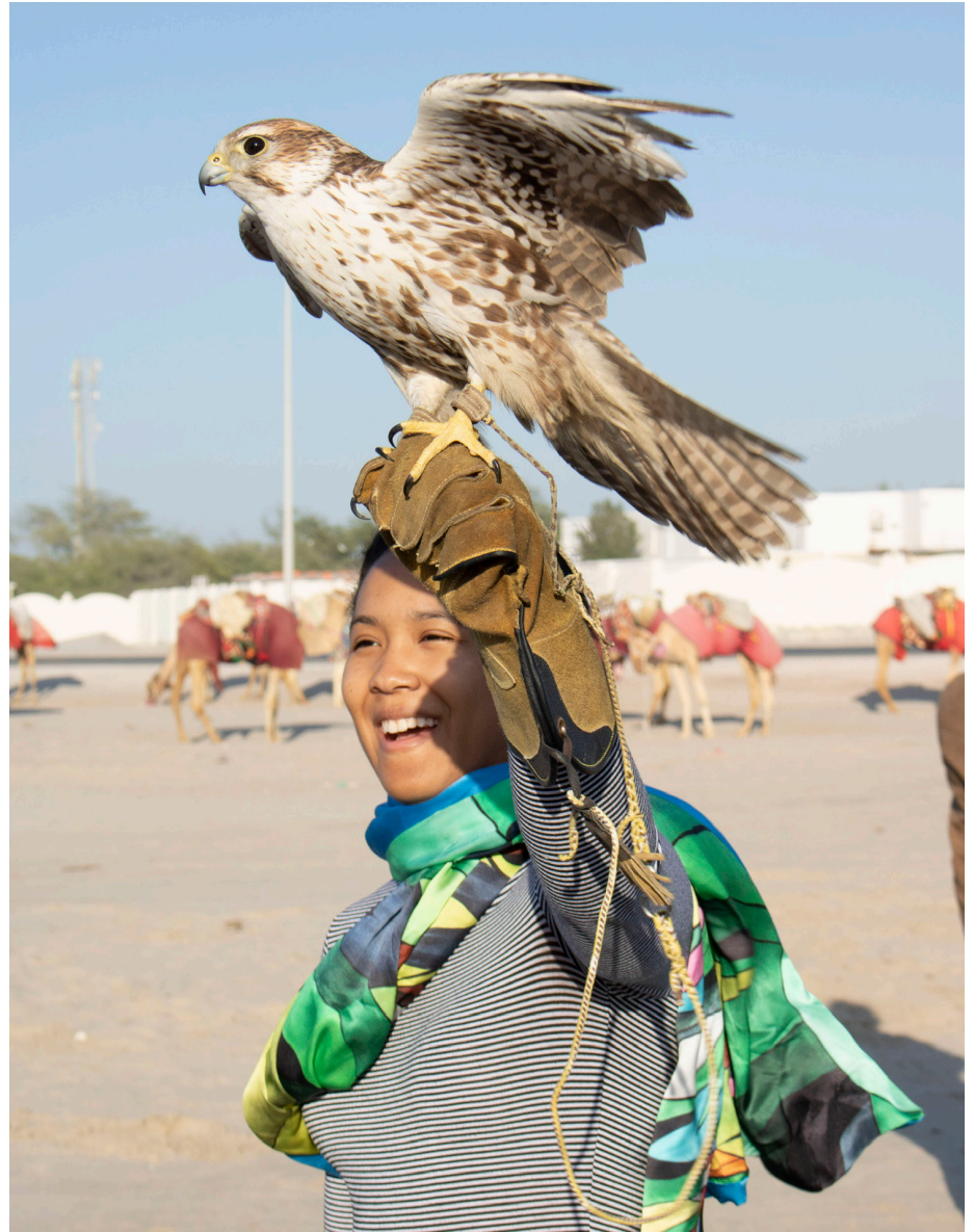
Kennedy with friend

as Bahrain, Saudi Arabia, the United Arab Emirates, Yemen, Egypt, and the Maldives severed diplomatic ties with Qatar. Saudi Arabia closed its airspace to all Qatar Airways flights. Soon after, all the GCC countries, with the exception of Oman and Kuwait, ordered all of their own citizens to leave Qatar, and they severed financial ties and trade agreements. Kuwait and Oman remain neutral, and in 2017,