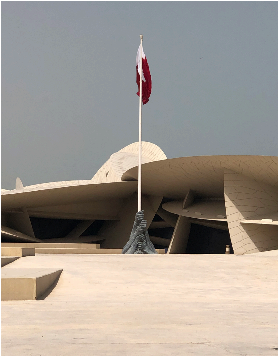
The National Museum

My adviser asked me to pick one policy issue from the trip to discuss. After much reflection, I decided to speak about Qatari national identity and the impact and reaction to the recent/present blockade of the nation. This quote from the wall of the National Museum of Qatar says it succinctly: “Qatari identity is rooted in this unique ge-