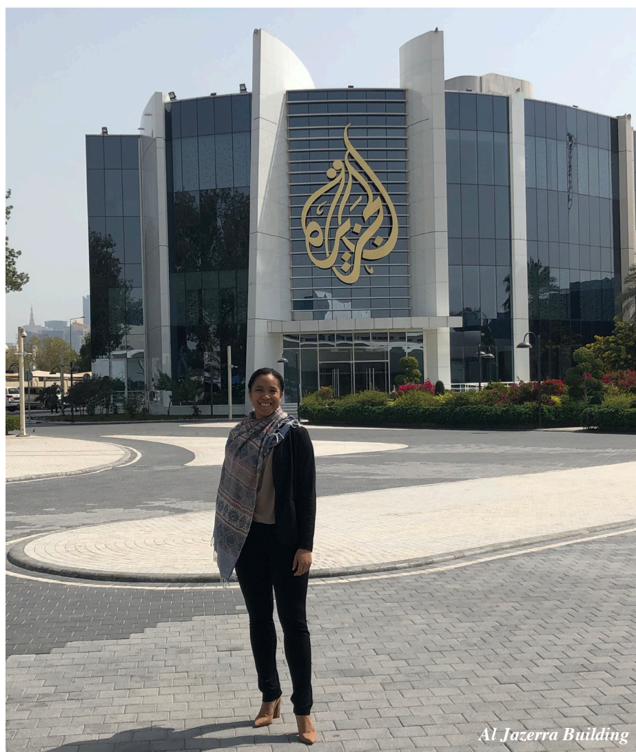
Al Jazeera Building