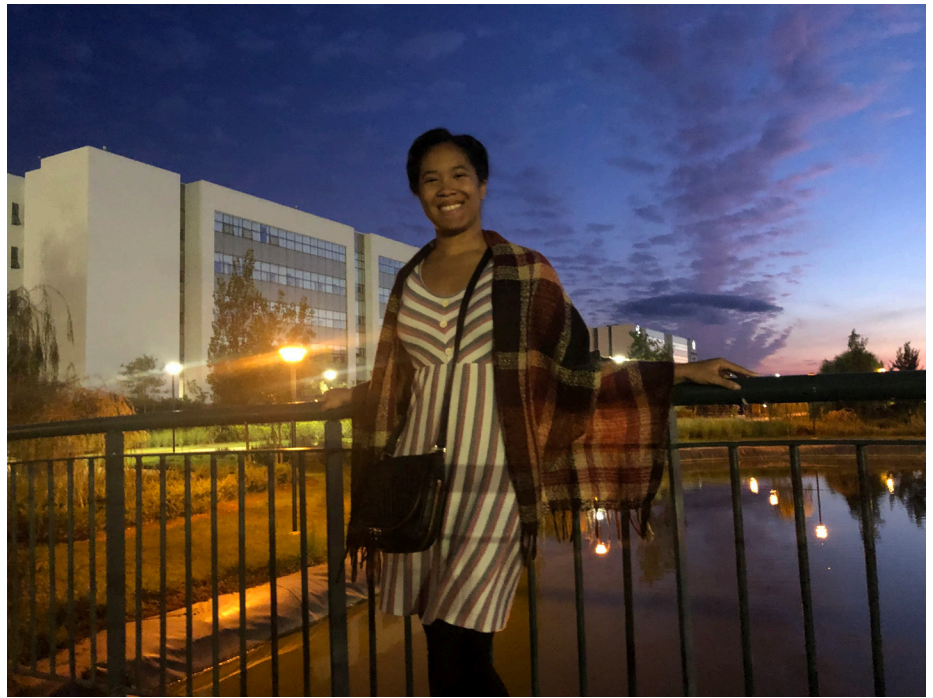
Evening on the URI campus

My other lesson is simple but often the hardest to put in practice. The singer Sonny Curtis said it best “love is all around, no need to waste it.” While I am sure Sonny in no way was talking about the beauty of Morocco in this 1980s hit, this lyric resonates with the most important lesson that I learned in Morocco: embrace the beauty around you. Although the experience had challenges, it was beautiful. Once travelers realize that the world is not your hometown, the experience of travel is richer. Food, drinks, bathrooms, weather, lifestyle is different when you leave