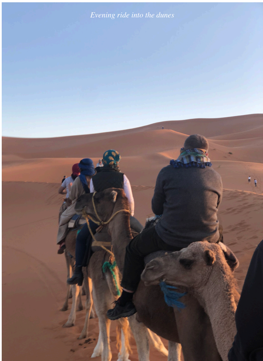
Evening ride into the dunes

The first lesson that I implore readers to adopt in travel and study abroad is not to be a tourist. This is not an encouragement for people to avoid exploring new locations with zeal, but a recommendation for a new approach to travel. While standing out is often a positive trait, I found that the best way to travel is to blend in. Learn from the locals, embrace the local language, and learn the culture. There is a difference between cultural appropriation and embracing and learning new cultures. Learn