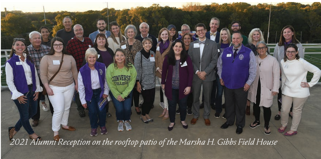
2021 Alumni Reception on the rooftop patio of the Marsha H. Gibbs Field House