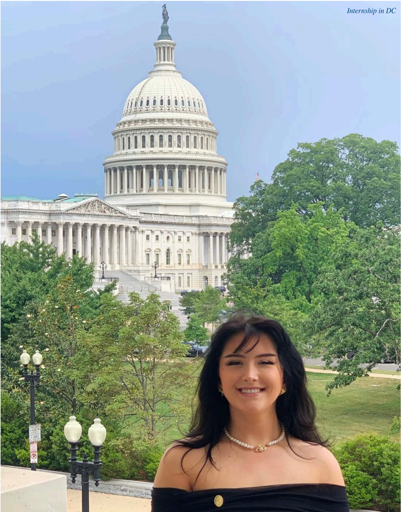
Internship in DC

a powerful presentation followed by a fantastic three-course dinner. Islamic Relief USA provided me further experiences that included numerous networking opportunities as well as site visits to the Capitol, the White House, the Eisenhower Executive Office Building, and the House of Representatives office buildings. Meeting the organization’s public affairs team initially was very intimidating. These experienced individuals with years of on the Hill and/or in nonprofits provided a model of what constant and tire-some advocacy entailed. However, they made me feel incredibly welcome and ensured that I adjusted well to life in D.C. I have had some wonderful external college experiences, including last year’s trip to Saudi Arabia with KSA Global. These are opportunities not to miss in one’s undergraduate years. They are great resume builders and they prepare you for the world after graduation. Do not miss out on these experiences of a lifetime.