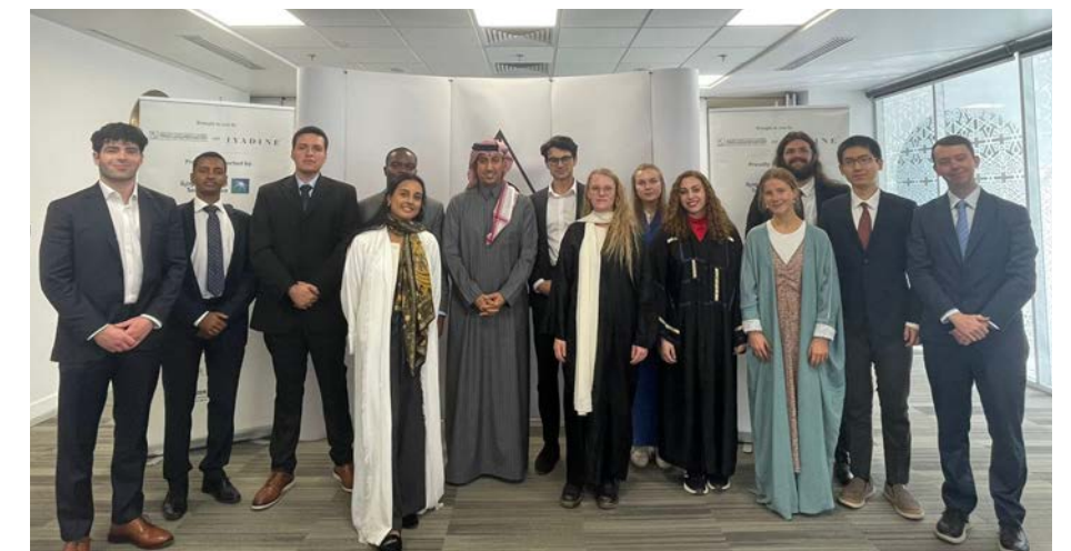
The entire group