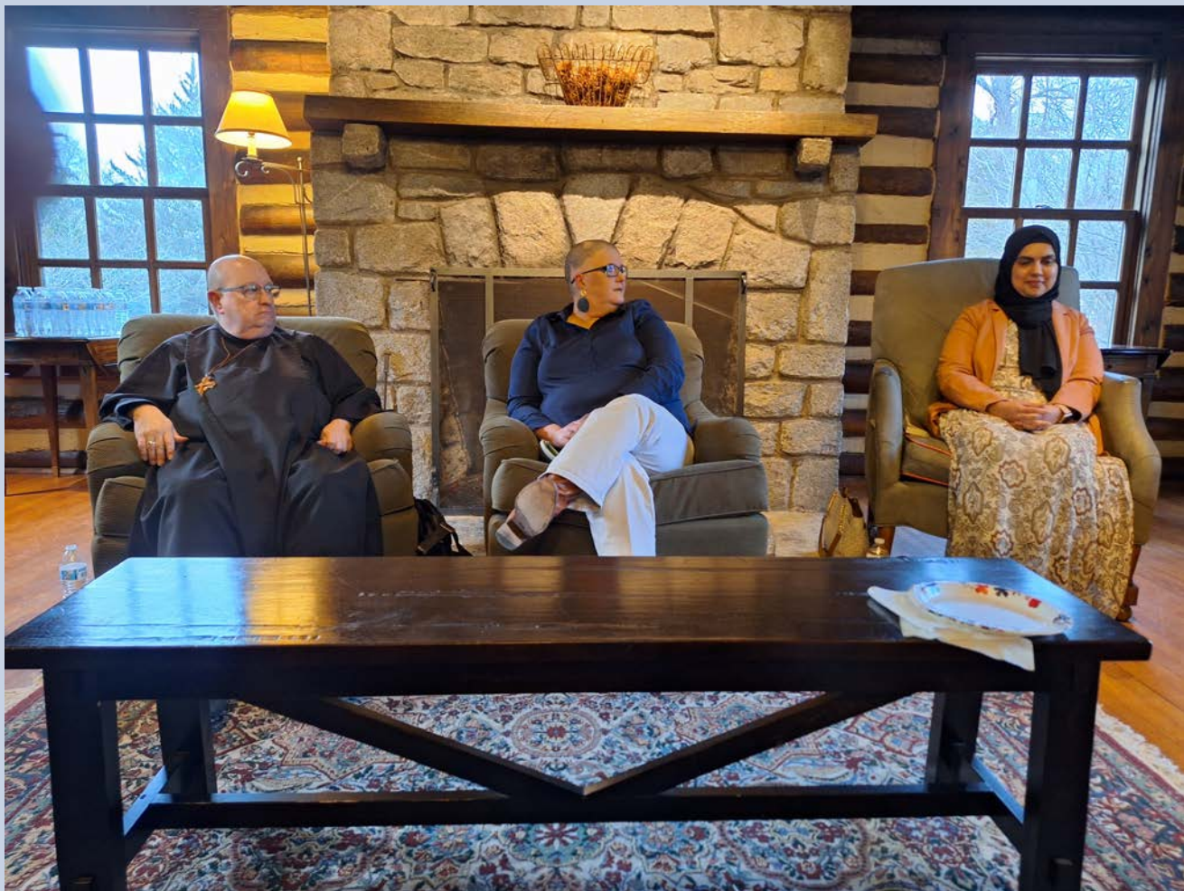
Religious Diversity Seminar