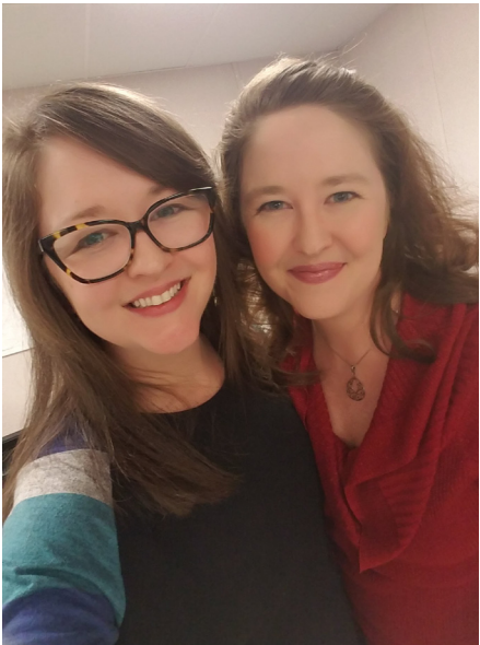
Poston Twins today