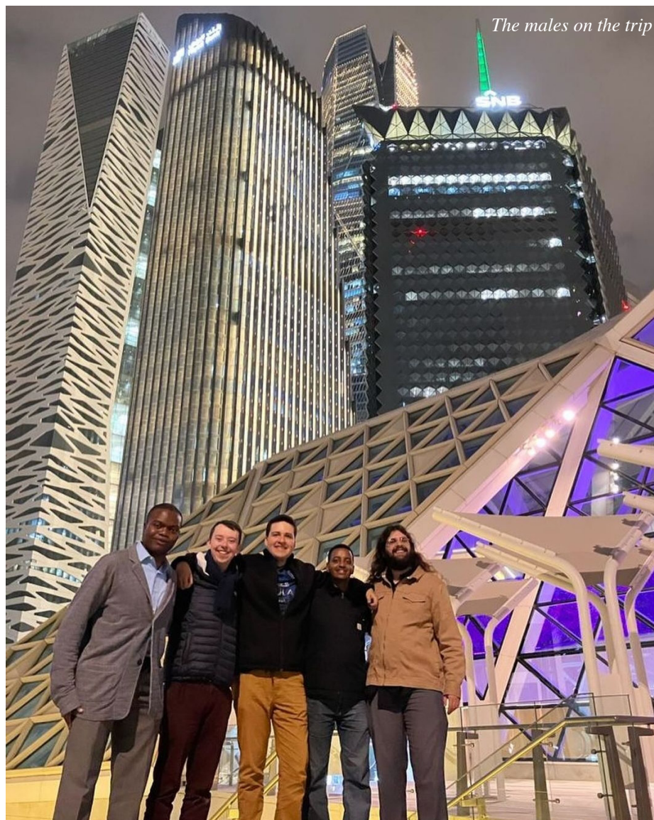
The males on the trip