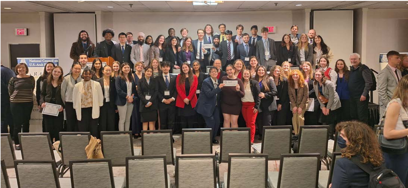
The two annual rival best delegations, Converse and Northeastern, pictured together at NUMAL.

In one of its most resounding performances in its history, the Converse Model Arab League delegation competing against 22 of top programs in the country, literally dominated the National Model Arab League competition this weekend in Washington, DC.