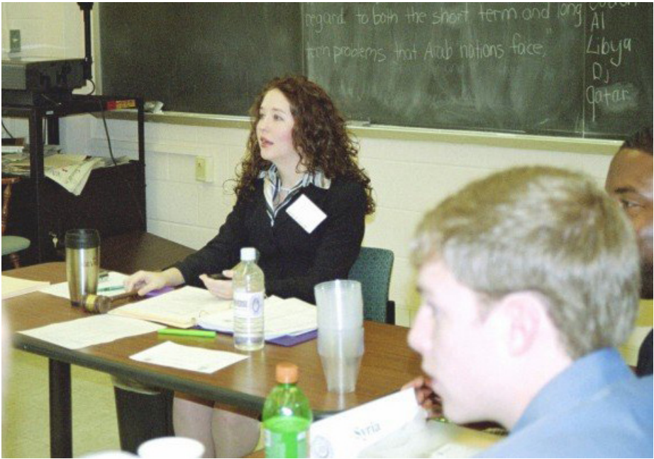
Poston Twins at work

One of the primary objectives of Model programs is to simulate