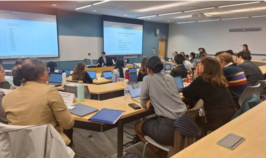
Palestinian Council NUMAL